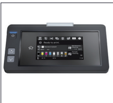
Touch panel control

4 Ink is shipped separately to the printer. The DTF process requires powder to be subsequently applied and melted in an oven. A heat press will be required for subsequent transfer onto garments and merchandise.