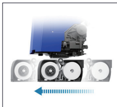
Fabric-based head wiper