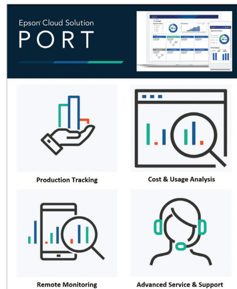
Epson Cloud Solution PORT

ECO PASSPORT NEP 1603 Nissenken www.oeko-tex.com