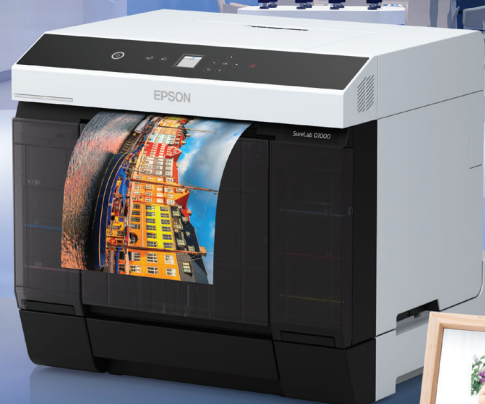
SL-D1030 with Duplex Feeder