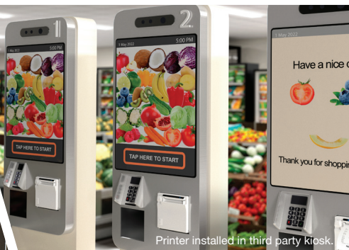
Printer installed in third party kiosk.