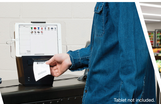
Tablet not included.