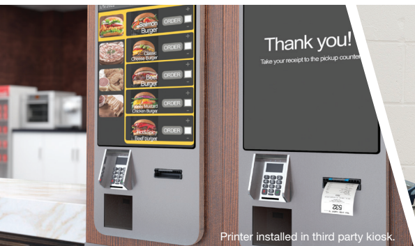
Printer installed in third party kiosk.

Our Epson® thermal receipt printers deliver easy integration, setup and offer options for self-ordering and self-checkout applications. The sleek Epson EU-m30 Kiosk Thermal Receipt Printer offers an array of innovative, kiosk-friendly features including a convenient mounting kit, remote management and effortless troubleshooting and serviceability. Our industry standard TM-T88VII Thermal Receipt Printer is an easy, drop-in solution for kiosks. The all-in-one OmniLink® TM-m30II-SL Thermal POS Receipt Printer is perfect for space-constrained areas. It features a built-in tablet mount for multiple configuration options and flexible positioning. Plus, it can accommodate up to four peripheral devices via USB and is online-ordering-ready.