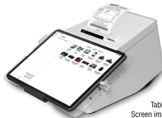
Tablet not included. Screen images simulated.