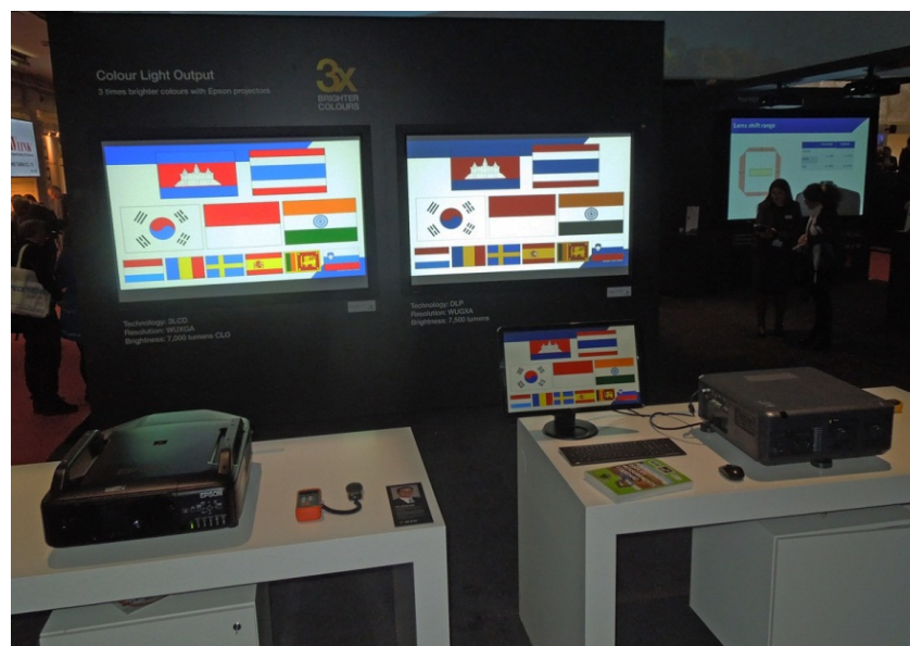
Figure 2. This image shows visible differences in color saturation between a 3LCD projector (left) and a single-chip DLP projector (right). The 3LCD projector is operating at 7,000 lumens and the DLP projector at 7,500 lumens.

For the 1DLP projector to achieve the color accuracy and intensity of the 3LCD image, brightness must be reduced to about 3200 lumens. This is caused by flashing the red, green, and blue segments of the color wheel at greater intervals and blanking during the white color segment. So there is an unavoidable trade-off between high brightness and color accuracy using 1DLP technology, one that does not occur with 3LCD projectors.