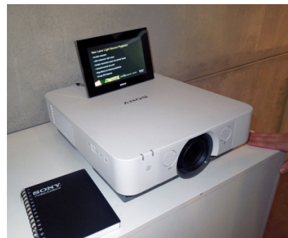
Figures 3a-b: A 4K 3LCD home theater projector (left) and a 4,000-lumen 3LCD projector powered by lasers.

Light sources are changing as well. There is a concerted effort by projector manufacturers to move beyond conventional short-arc lamps that use salts of mercury to more environmentally friendly technology. At present, the leading contenders are lasers (used directly and with phosphor color elements) and light-emitting diodes (discrete red, green, and blue chips). There are also hybrid light engines that combine both lasers and LEDs.