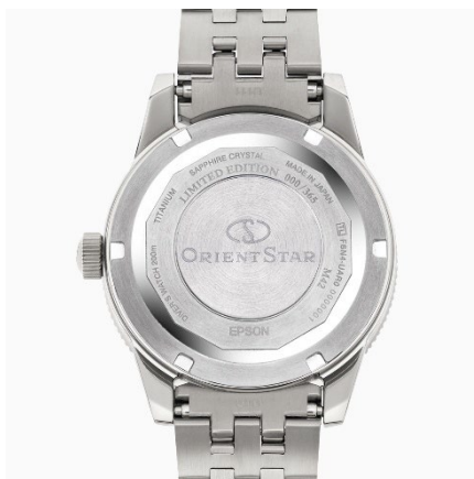
Caseback with engraving.