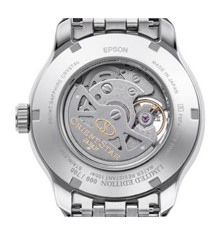
■ Case back with engravings (RE-AV0B11E)