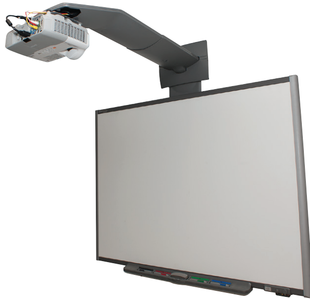
Projector, mount and whiteboard are not included.

1 SmartWay is an innovative partnership of the U.S. Environmental Protection Agency that reduces greenhouse gases and other air pollutants and improves fuel efficiency.