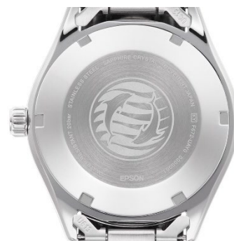
Case back with engravings.