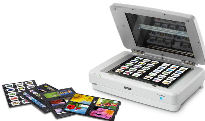
Shown with optional Transparency Unit, sold separately. Transparency Unit required to scan film and negatives.

Epson Expression 13000XL B11B257201 Transparency Unit B12B819221