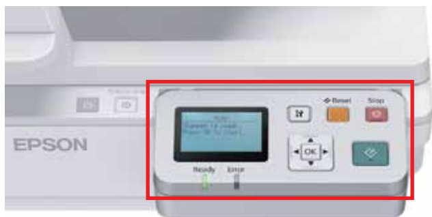
Easy navigation of job settings with LCD panel on network interface panel.

With the optional network interface panel, scanners can be shared amongst a work group without the need for USB connections. Users can easily select a desired PC within the network via the Document Capture Pro application installed on a Client or Server PC.