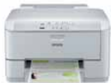
WorkForce Pro WP-4011

Improve your productivity with the WorkForce Pro WP-4011 networkable printer that delivers excellent quality at very low running costs.