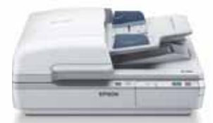
WorkForce DS-7500 40ppm/80ipm