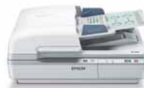
WorkForce DS-6500 25ppm/50ipm

Epson's latest series of A4 WorkForce scanners deliver greater productivity and reliability with built-in 100-sheet ADF and high daily scan volumes of 3,000 pages for DS-6500 and 4,000 pages for DS-7500 with ideal scanning speeds of up to 40ppm/80ipm. Bundled with Document Capture Pro software which offers Scan-to-Print, Scan-to-Cloud, email and FTP, document management becomes a breeze.