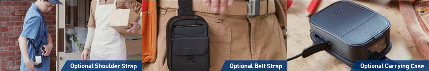
The optional shoulder and belt strap allows users to access the printer easily. An optional carrying case further protect your printer against adverse conditions.