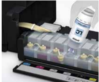
Specially fitted tubes ensure reliable ink flow without leakage

Epson's original EcoTank system is engineered for easy, mess-free refills. The special tubes in the printer are designed to ensure smooth and reliable ink flow at all times.