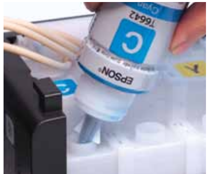
Smart tip design for easy, mess-free refills