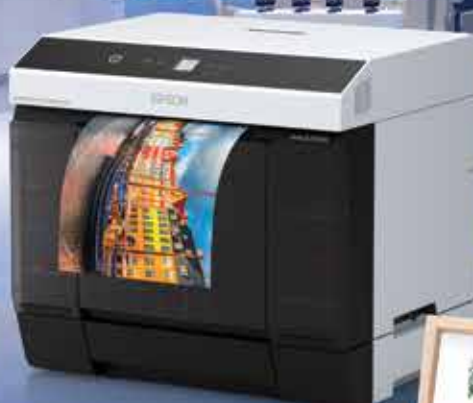
SL-D1030 with Duplex Feeder