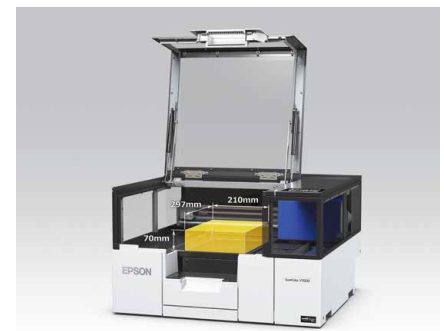
Print on 3D objects, up to 70 mm thickness