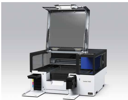
Complete front operation

1 Figures are default print speeds only; actual production times will depend on workflow, material selection, production process, print mode, equipment settings, computing platform, file format/size and networking.