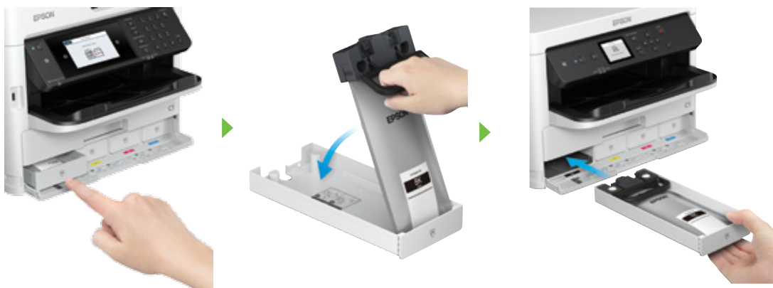
Designed for easy replacement of ink packs