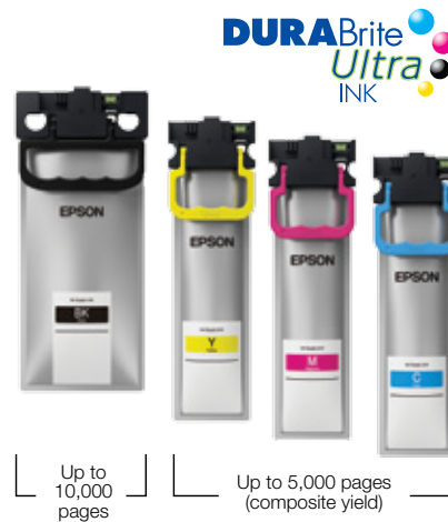
Enjoy greater cost-savings with these high-volume ink packs

In addition, Epson's DURABrite™ Ultra ink delivers laser-like quality prints that are water and smudge-resistant.