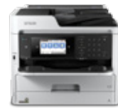
WorkForce Pro WF-C5790 Print/Scan/Copy/Fax