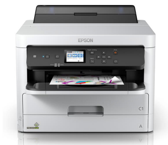
WorkForce® Pro WF-C5290 (C11CG05201)