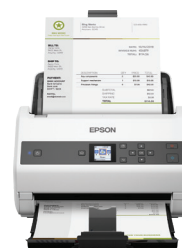
DS-870 Color Duplex Workgroup Document Scanner (B11B250201)