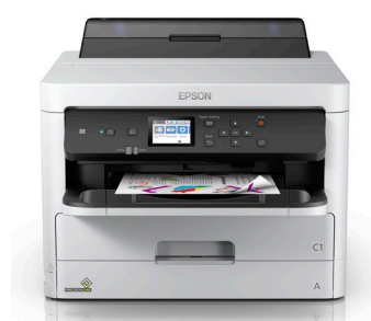
WorkForce Pro WF-C5210 (C11CG06201)