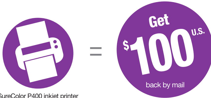
SureColor P400 inkjet printer

Purchase a SureColor ® P400 or SureColor P600 inkjet printer and receive the following back by mail: