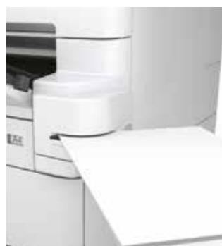
Manual Stapler* *WF-C879R only