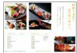
High quality Inkjet paper