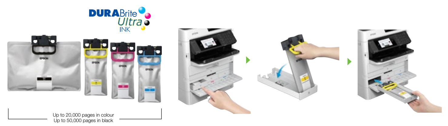
Enjoy greater cost-savings with these high-volume ink packs

In addition, Epson's DURABrite™ Ultra ink delivers laser-like quality prints that are water-, fade- and smudge-resistant.