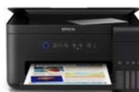
EcoTank L4150 All-in-One Printer

The design of the new EcoTank printers makes them sleek and compact. With the tank integrated into the printer, these printers have the smallest footprint* amongst all brands of ink tank printers. Enjoy spill-free refilling with individual bottles which have unique nozzles that fit only into their respective tanks. Auto-duplex printing** affords users up to 50% savings on paper costs by printing automatically on both sides of paper. Remain connected with the option to print wirelessly over network or directly from your mobile devices using Wi-Fi Direct. Rejoice in exceptional print quality with the use of pigment black ink which produces water and smudge-resistant printouts.