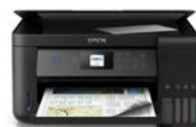
EcoTank L4160 All-in-One Printer