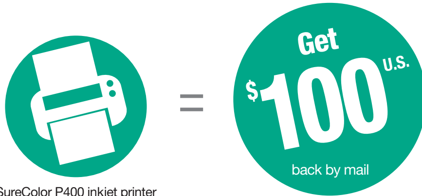
SureColor P400 inkjet printer

Purchase a SureColor ® P400 or SureColor P600 inkjet printer and receive the following back by mail: