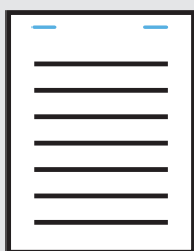
Top Edge (2)