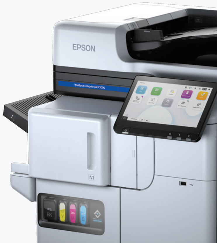
Printers shown with optional accessories.

The all-in-one chip replaces bulky, complex maintenance parts—which can result in reduced waste and fewer service visits. And by eliminating the need for heat, this innovative technology minimizes the number of steps needed to print while supporting low power consumption.