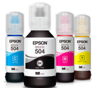
Replacement ink bottles

PrecisionCore® Heat-Free Technology — Heat-Free technology enables instant printing without the need for heat, reducing energy consumption by not using heat in the printing process.