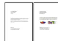
#1 Black Text #2 Colour

1 Print speed (Pages Per Minute) is calculated when printed on A4 plain paper in the fastest mode, 10 x 15 cm photo print speed when printed on Epson Premium Glossy Photo Paper. Print speed may vary depending on system configuration, print mode, document complexity, software, type of paper used and connectivity. Print speed does not include processing time on host computer.